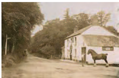
The Bickford Arms at Brandis Corner around 1900

Combine dry ingredients add wet ingredients, half fill muffin cups. Bake at 200 degrees, Gas mark 6 for 20 minutes.