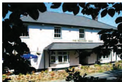
The Bickford Arms in 2005 after rebuilding and restoration