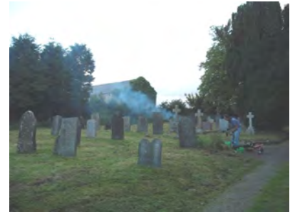
asking why haven't you started strimming yet