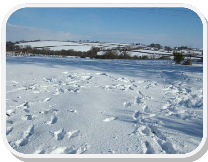
View from the side of Holy Trinity Church across the fields, T Fairbrother

Happy Christmas and all Good Wishes for 2017