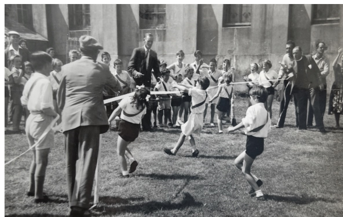
Inter-school sports day with Sutcombe School in c.1960 in field behind the chapel