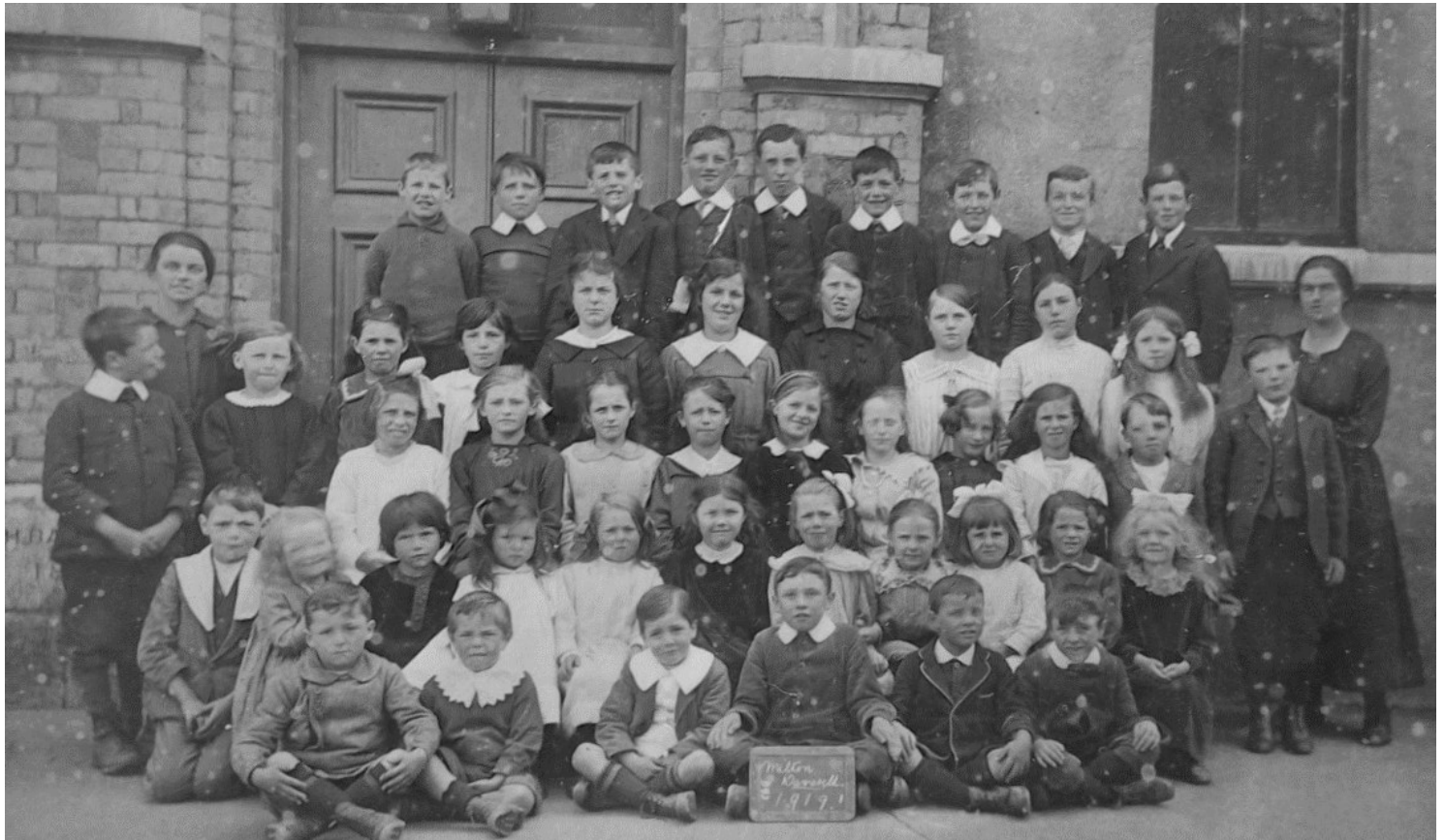
Milton School 1919

Records about the School are held in the North Devon Record Office in Barnstaple.