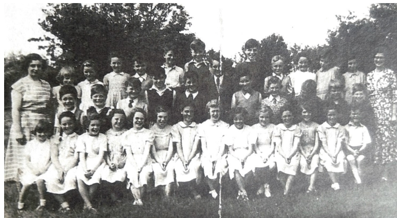
Another one in the field ...about 1955