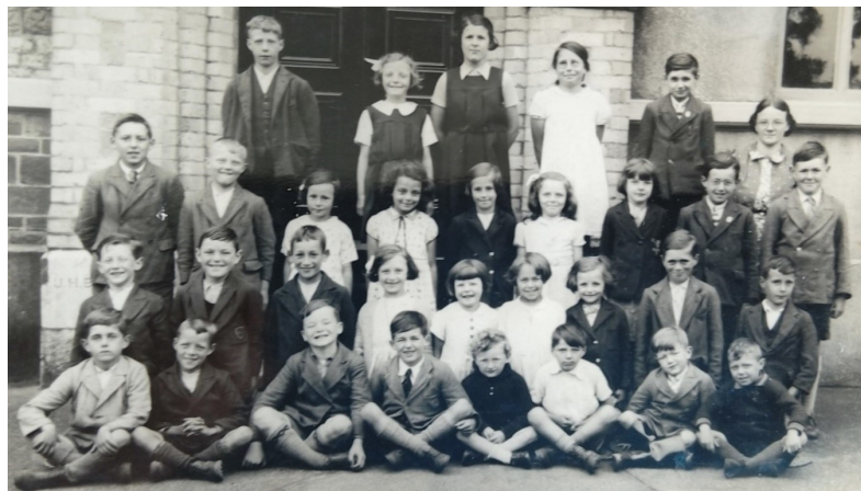
From about 1938/1939.....