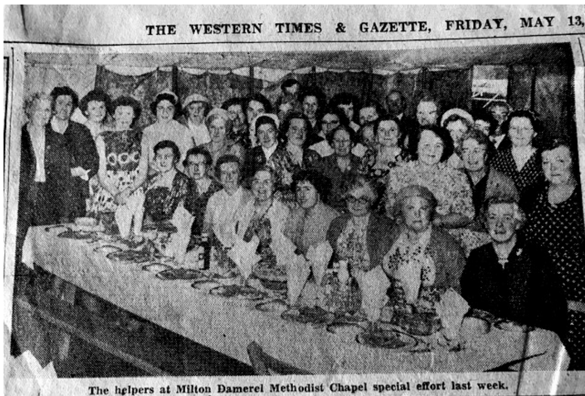
The helpers at Milton Damerel Methodist Chapel special effort last week.

The helpers were mainly volunteers from the parish; many faces are distinguishable although copy is fuzzy! Other helpers would have been invited to return to their home parish to help for this prodigious occasion.