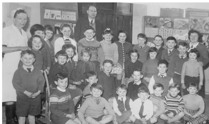
Another in the Schoolroom about 12 months later (1962)