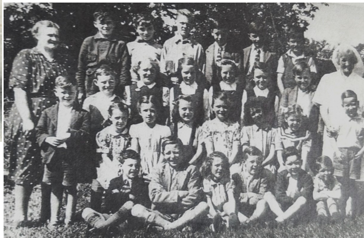
Probably taken in the field... 1950