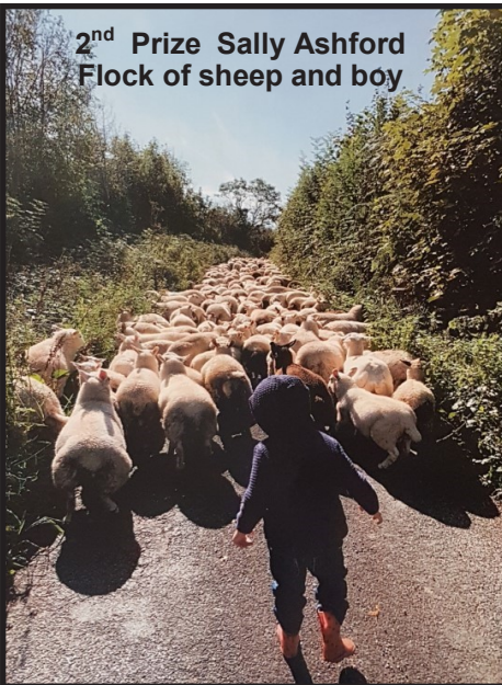
2 nd Prize Sally Ashford Flock of sheep and boy