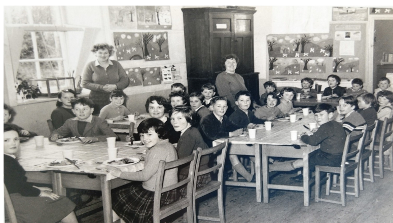
In the Schoolroom – lunch is served ... about 1961