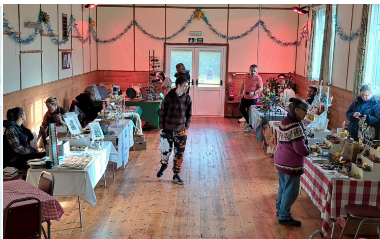
Parish Hall winter craft and gift fair in November