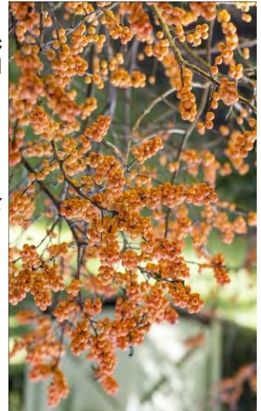
Ilex verticillata 'Winter Gold' RHS

RHS Glow, our stunning annual illumination event. Check website for details selected nights 21 November to 30 December. Booking essential.