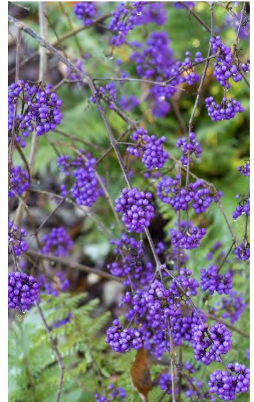
Callicarpa bodinieri var. giraldii 'Profusion' RHS