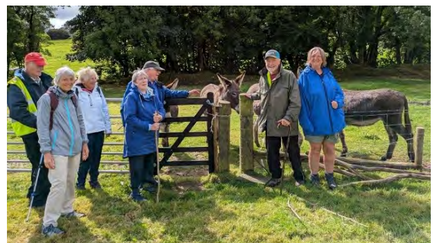
A few members of our group admiring the donkeys in a field at Bradworthy