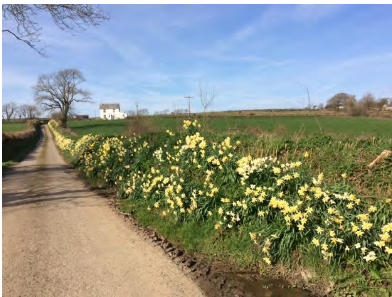
Daffodils between Whitebear Cottage and the Parish Hall