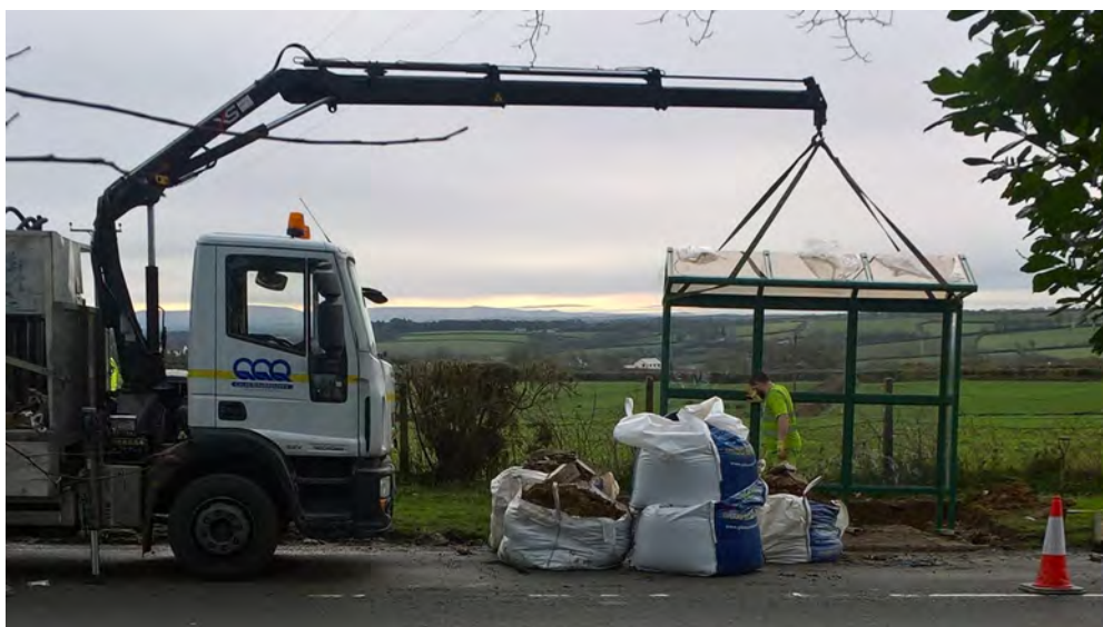
Milton Damerel gets a new bus shelter