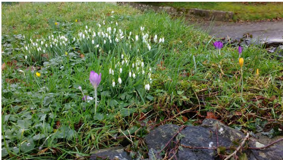
Spring showing that it is here.

Do you know we have a website www.miltondamerel.com and a facebook page too?