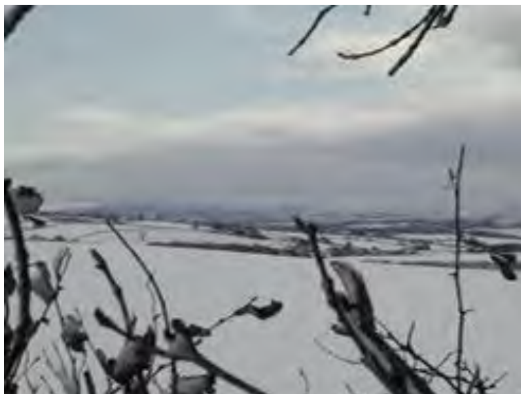
Looking South from Higher Grawley.