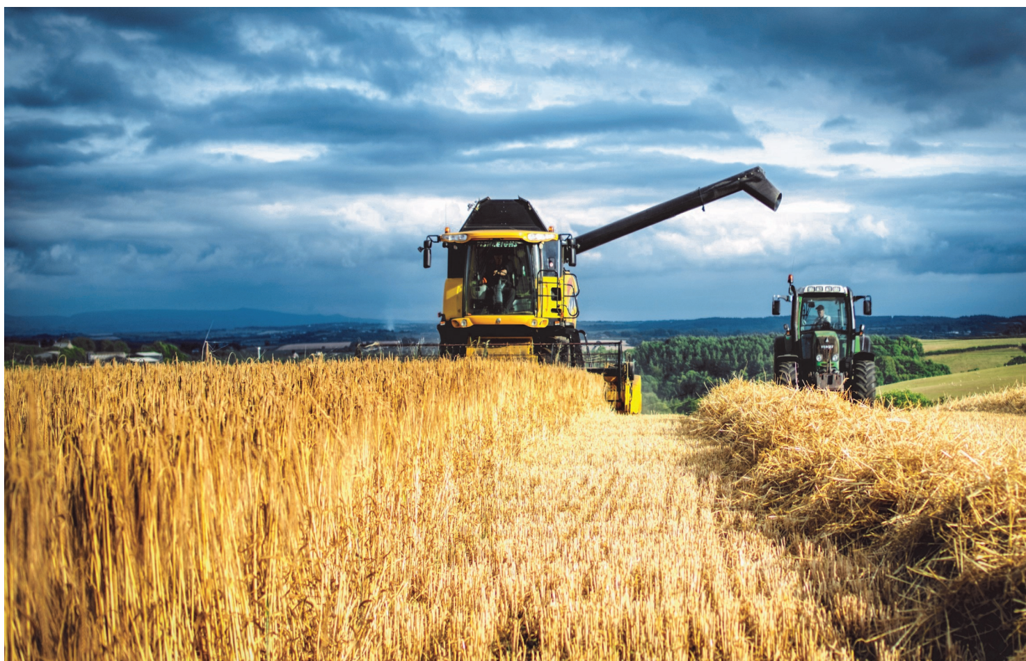
Image from 'A Year in a rural Parish' the Milton Damerel video.