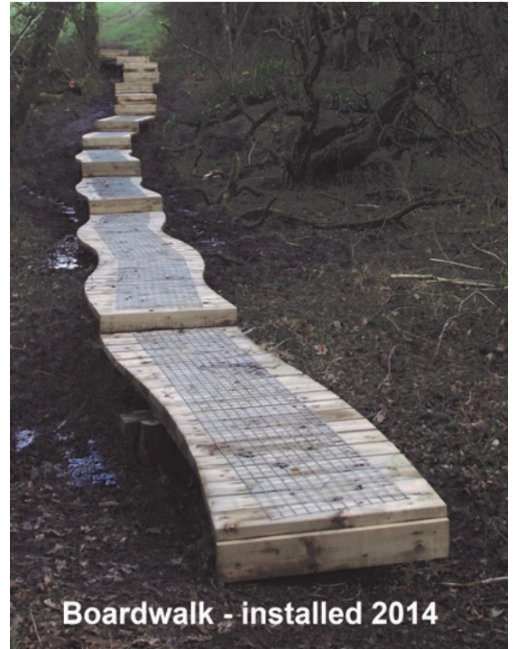
Boardwalk - installed 2014

The Parish Council would be pleased to hear from any person(s) who might be interested in helping them to undertake these regular inspections and light