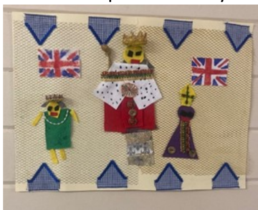
2nd prize - Felicity Piper