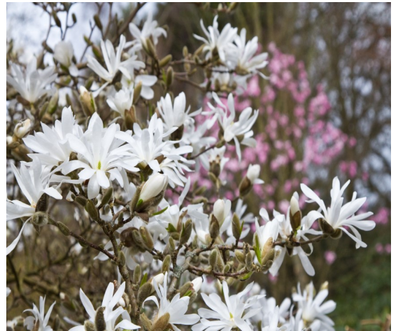
Magnolia stellata