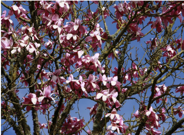
Magnolia campbellii (Raffillii Group) 'Charles Raffill'

There are few plants that can match the elegance and sheer flower-power of Magnolias. Around March (and beyond) Rosemoor is furnished with an extravagant display of blooms across the gardens, showing off a huge variation in colour, size and shape across the many different species and cultivars.