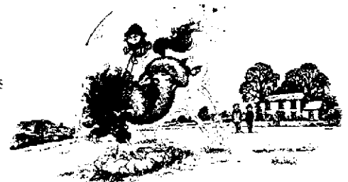
"That's one Christmas present she won't break in a hurry."